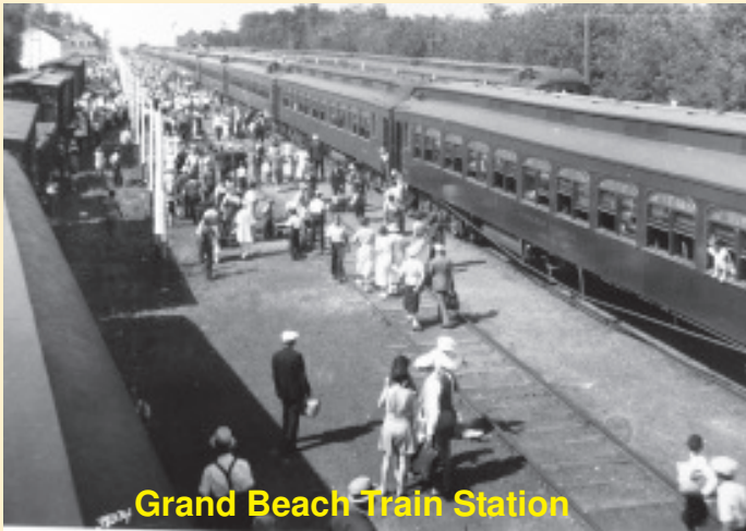
Grand Beach Train Station